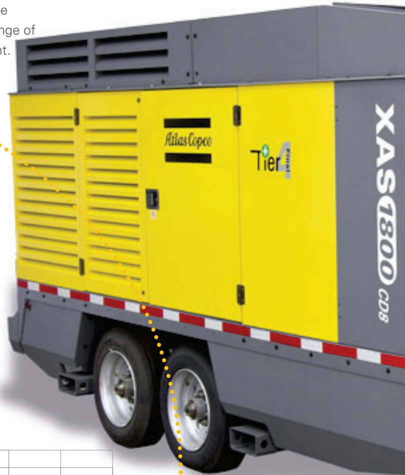
Variable Flow and Pressure (Operating range)

The all new XAS 1800 CD8 has extended its operating range, over the iT4 model, allowing up to 200 psi making it the most versatile machine its class. The variable flow and pressure allows for operation in a wider range of applications. Specifically for rental customers this increases the applications where the machine can be used increasing fleet utilization and ROI.